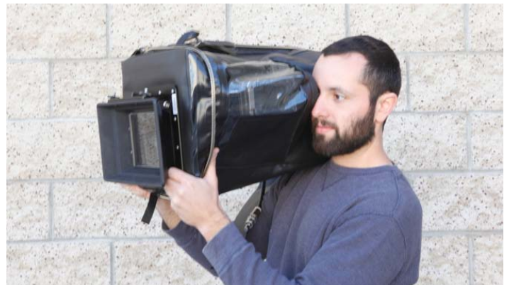
Hand Held Splashbag