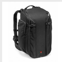
Professional camera backpack for DSLR/camcorder