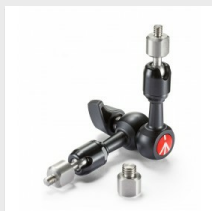
photo variable friction arm with Interchangeable Attachments