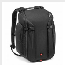
Professional camera backpack for DSLR