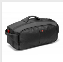
Pro Light Camcorder Case 197 for PDW-750, PXW-X500, PMW-350K